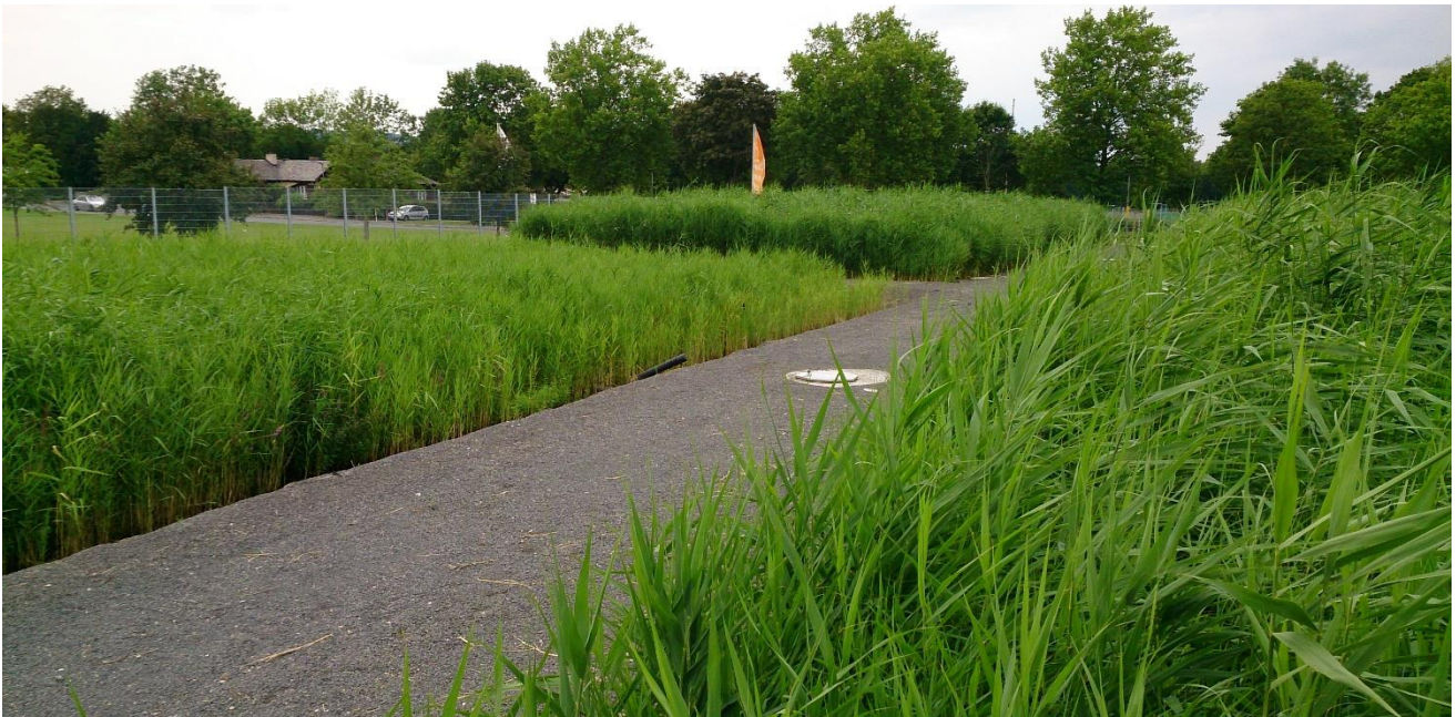
Reed-planted constructed wetlands in full vegetation.