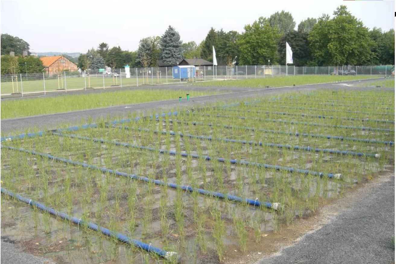
Constructed wetlands shortly after planting.